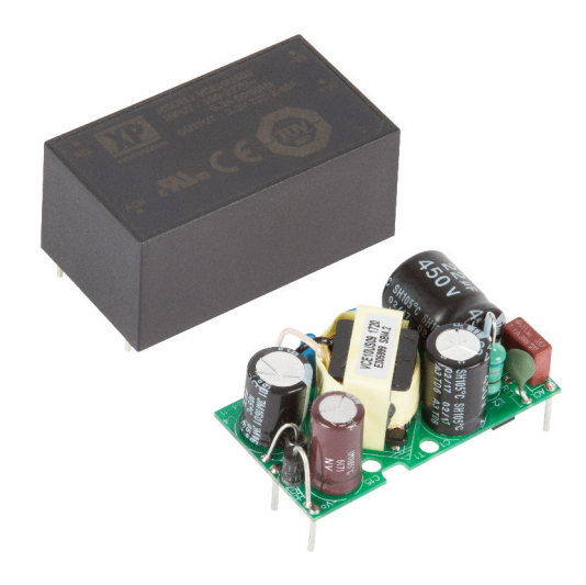
Figure 2: The 3 Watt VCE03 series from XP Power meets EN 62368 and EN 60335.

EN 60335 is certainly addressing the reality of modern household equipment – perhaps future editions will need to address safety implication of their wireless connectivity as well.